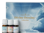
Divine Destiny Collection Item No. 38479