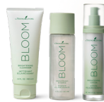
BLOOM by Young Living™ Brightening Skin Care Collection Item No. 30316